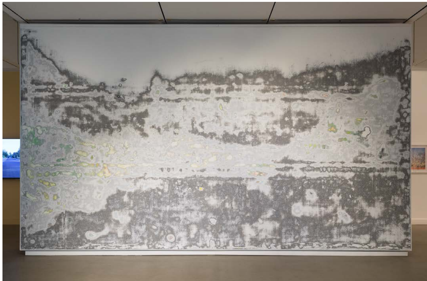
Carla Liesch Time Prolapse 2017 trace of past labour on gallery wall 600 x 350 Courtesy of the artist