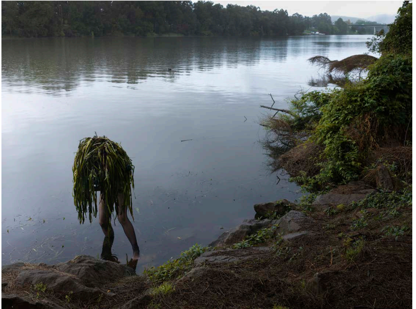
Nicole Monks with Luke Butterly (collaborative photographer) Native to this land 2017 Series of 10 c-print on custom wood, edition 1 of 6 +2AP 18 x 24 in (per image) Courtesy of the artists