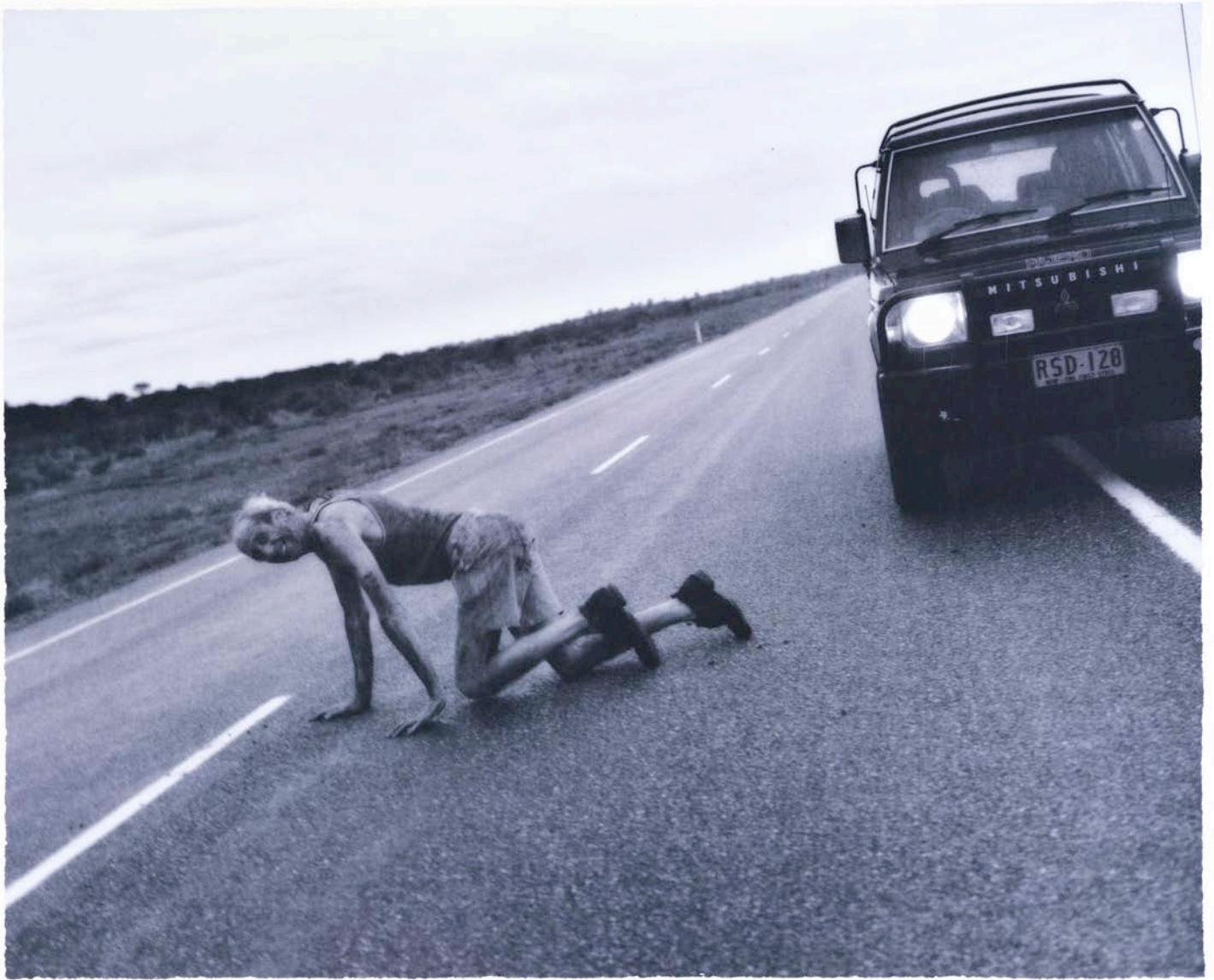
Tracey Moffatt Up in the Sky #4 1997 offset print 61 x 76 edition 15 of 60 Copyright courtesy of the artist and Roslyn Oxley9 Gallery, Sydney