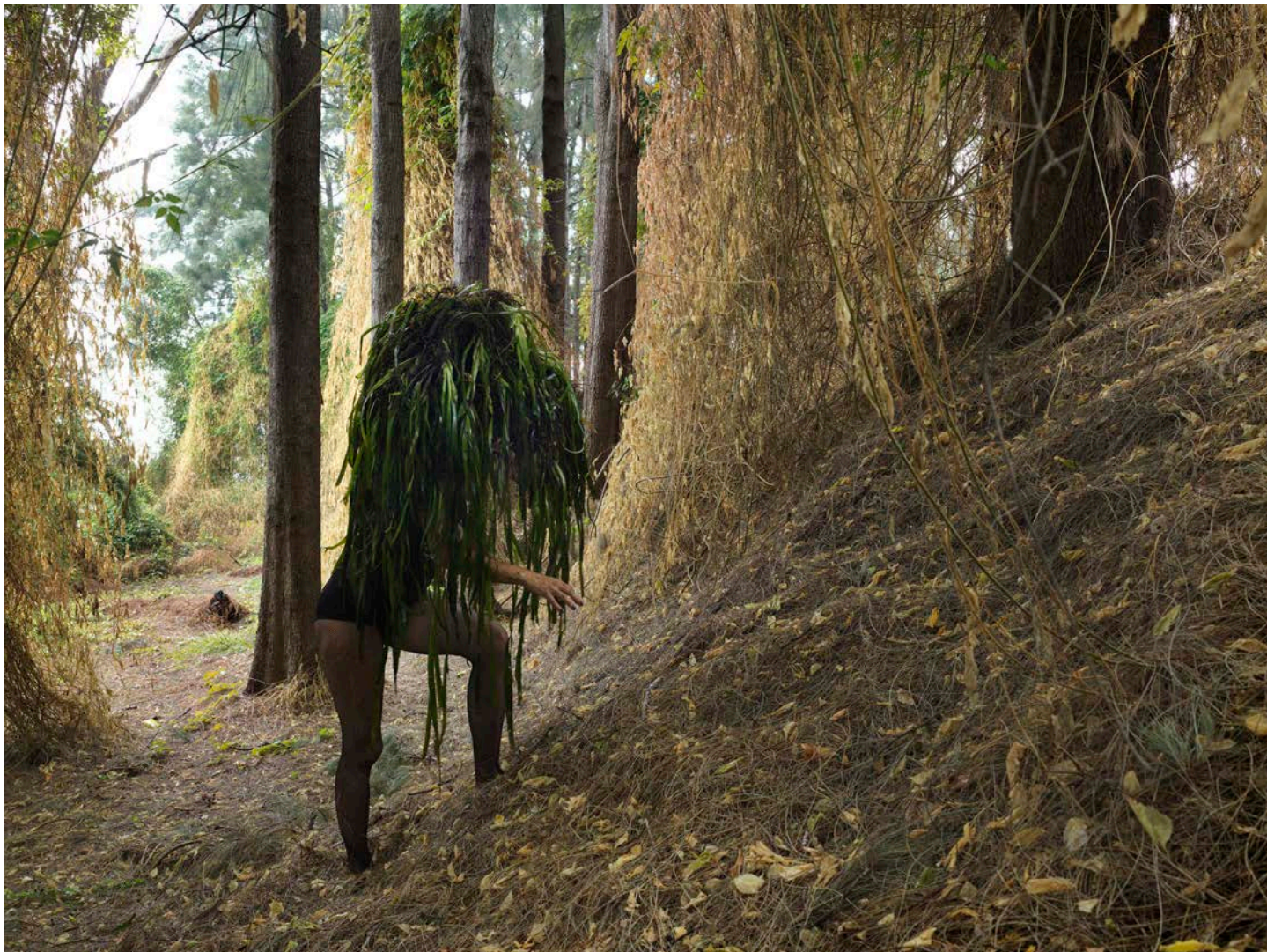
Nicole Monks with Luke Butterly (collaborative photographer) Native to this land 2017 Series of 10 c-print on custom wood, edition 1 of 6 +2AP 18 x 24 in (per image) Courtesy of the artists